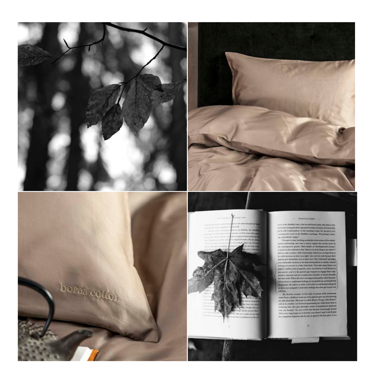
Sand - a lighter shade of brown with a warm and goldish glow is a gorgeous mix of earthy and glamorous. Brown is a friendly - organic and approachable colour - gold is sensual and sensitive - and as a blend - it becomes deep and intense. The colour of sand adds a richness to the higher quality satin and will complement any bedroom perfectly